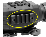
Side Weaver Rail