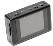
Portable Video Recorder