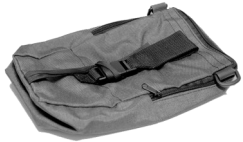
Soft Carrying Pouch