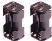
2 Quick Swap AA Battery Holders